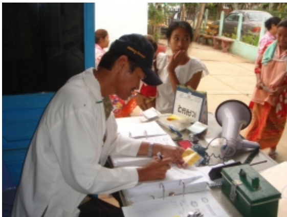
Distribute number to the out-patient

He send his word and healed them Psalm 107:20 Now is the time to bring the healing power of God to the nations.